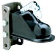
0090155 B0090160 B23309