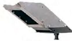
AB-34 & AB-34HD