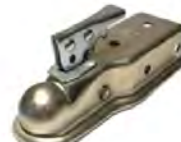
TTC3001Z TTC3002Z TTC3003Z TTC5003Z

A:Ball Size B:Channel Size C:Capacity D:Latch Type E:Mount Type F:Material Size G:MFG