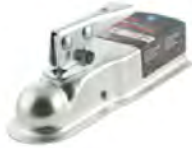
CU25105 CU25128 CU25131