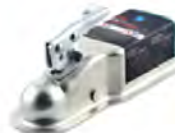
CU25100 CU25135 CU25138