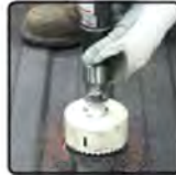
Use the pilot hole for error-free drilling