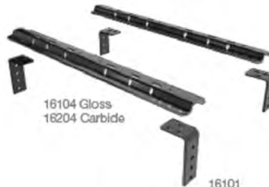
16104 Gloss 16204 Carbide