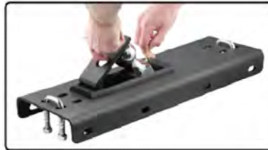
Lower ball, close cover