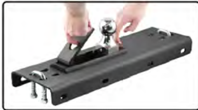
Pull ball pin, raise cover