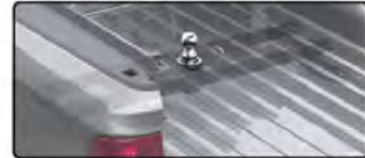
Double Lock EZr center section and installation kit in truck bed