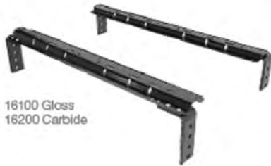
16100 Gloss 16200 Carbide