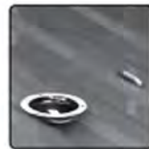
Ball stored, without rubber cover