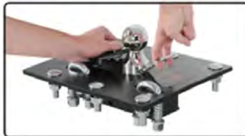
Pull ball pin, raise cover