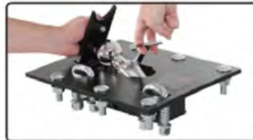
Lower ball, close cover