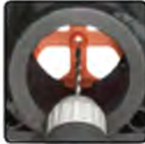
Simply drill up from under the bed