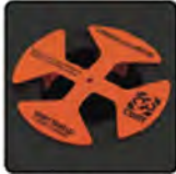
Exclusive center locator saves time