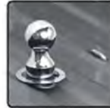
Ball up, ready for coupling