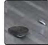
Rubber cover included