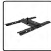
Provides 3' offset gooseneck hitch