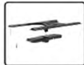
Replaces Double Lock trailer ball