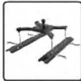
Attaches to 5th wheel rails