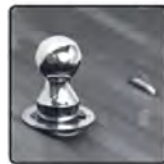
Ball up, ready for coupling