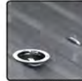
Ball stored, without rubber cover