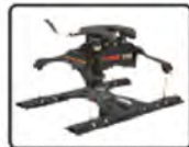
Quickly provides 5th wheel rails