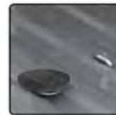
Rubber cover included