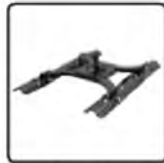
Quickly provides gooseneck hitch