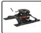
Accepts 5th wheel hitches and rollers