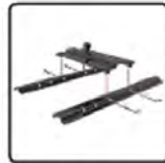
Attaches to 5th wheel rails