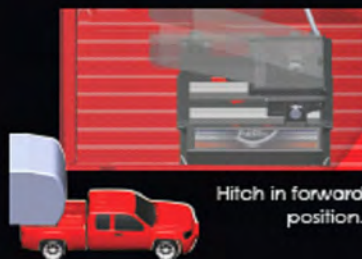
Hitch in forward position.

Stop worrying if you're going to slam your trailer into your cab when making tight turns! All SuperGlides feature our patented cam-glide technology, and with a minimum of 14" of travel, all you have to do is get in and drive!