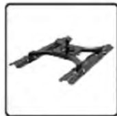
Quickly provides gooseneck hitch