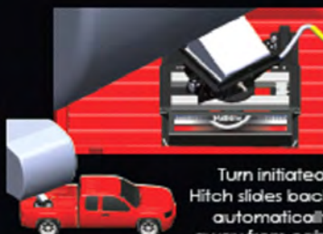
Turn initiated. Hitch slides back automatically away from cab.