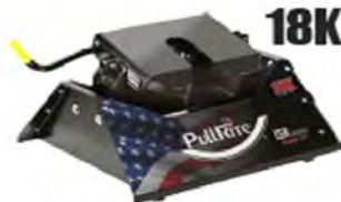
18K — MFR# 2100