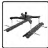
Attaches to 5th wheel rails