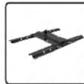
Provides 3' offset gooseneck hitch