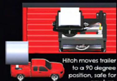
Hitch moves trailer to a 90 degree position, safe for any turn.