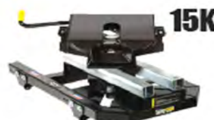
15K — MFR# 2700