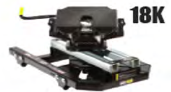
18K — MFR# 2900