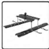
Attaches to 5th wheel rails