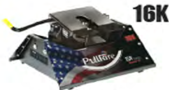
16K — MFR# 1900

Please note, in order to determine the total tow of a system, you must consider the weight ratings of each component in that system. This includes, but may not be limited to, the rating of the tow vehicle, the fifth wheel hitch, and the hitch's mounting system. Actual tow of the system will be equal to the lowest rated component.